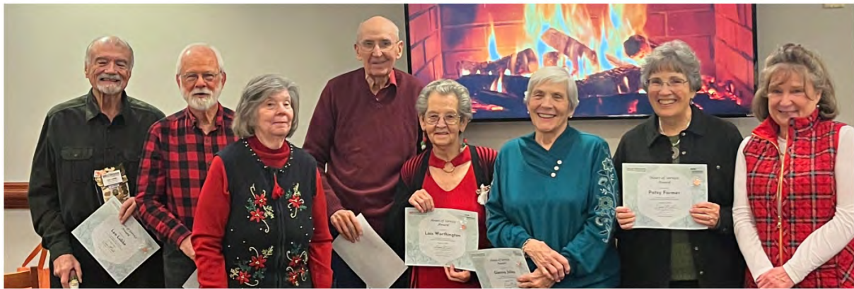
100+ Volunteer Hours