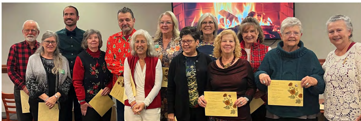
Demo Garden Volunteers