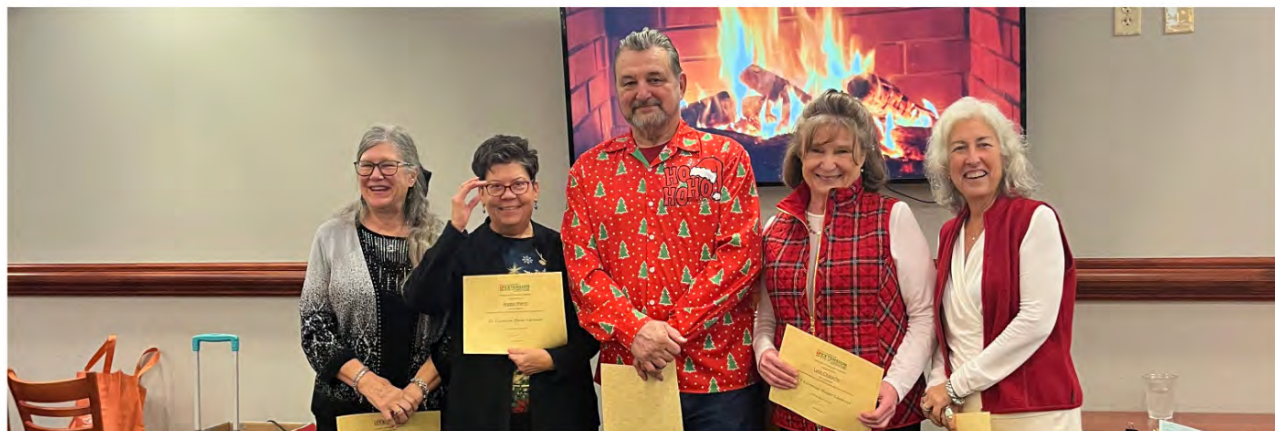
2025 Master Gardener Class