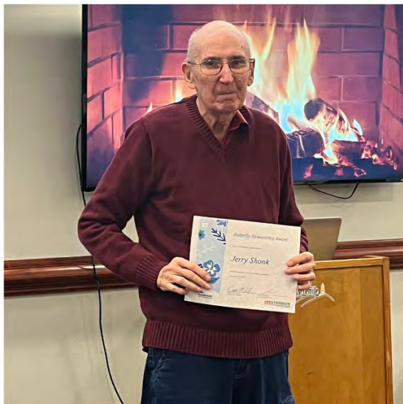
Jerry Shonk Butterfly Stewardship Award