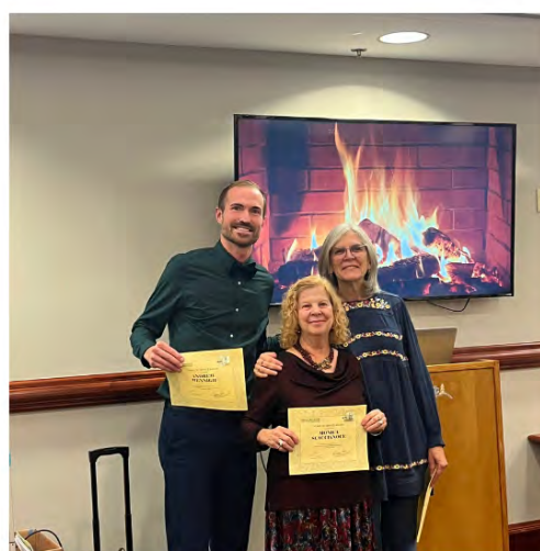
Three Years of Service