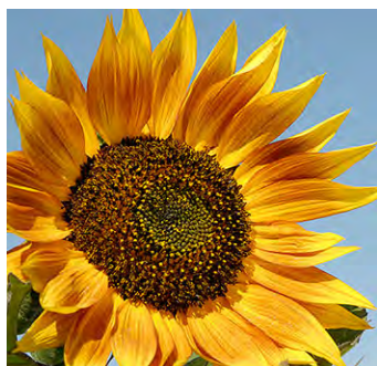
On the cover: Sunflowers (Helianthus annuus) Did you know the Sunflower was domesticated in the US?