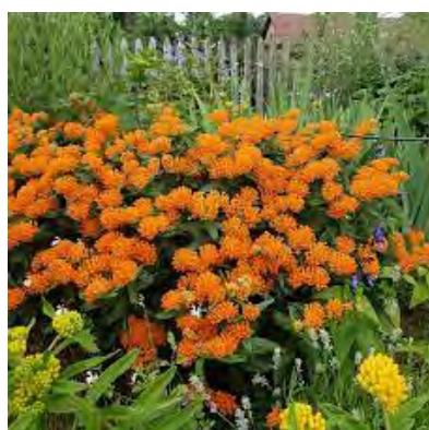
On the cover: Butterfly Weed (Asclepias tuberosa) One of the showiest native wildflowers, Attracts butterflies and bees, particularly a Monarch butterfly magnet.