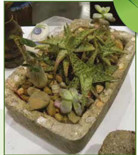
The hypertufa pictured is “fresh off the press” as Linda took it at the International Master Gardener Conference that we just returned from in Kansas City! One of their county MGs made this and it was for sale in their store!

This fast-paced one-hour presentation will begin with the history of hypertufa (man-made rock) garden containers. A short history will show the beginning of trough planters, and then will move to the steps