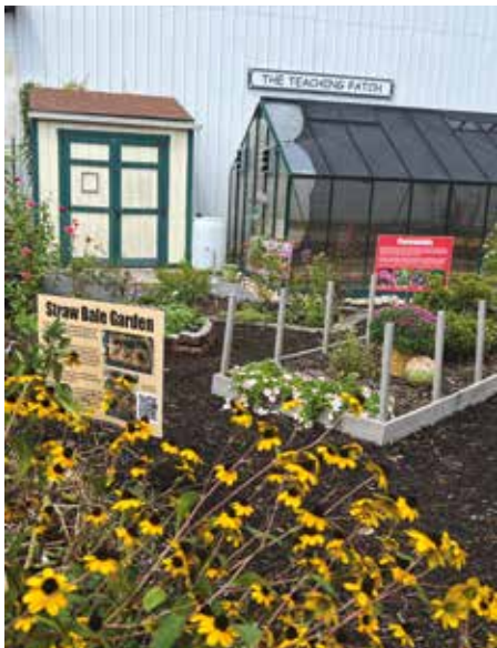
On the cover: A beautiful photo of the fair-ready demonstration garden.