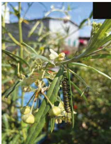
On the cover: Monarch caterpillars at the demo gardens.