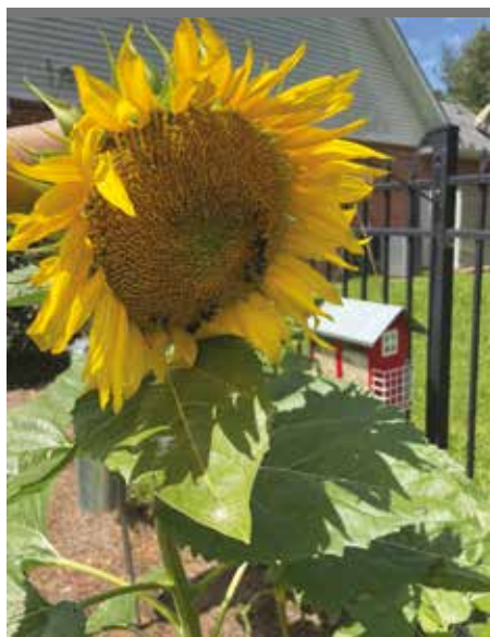
On the cover: Pollinators are loving the bird-planted sunflowers.