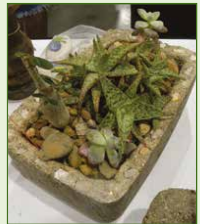
The hypertufa pictured was taken at the International Master Gardener Conference.