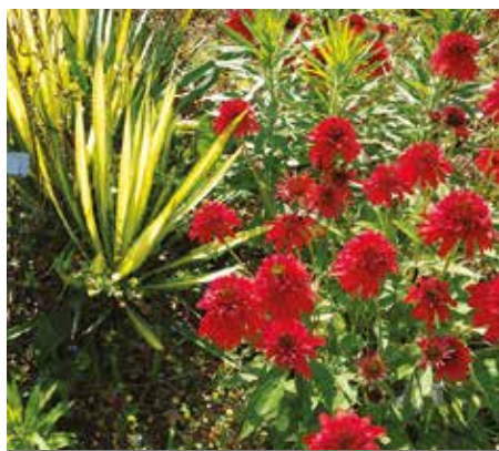
On the cover: Double Scoop Cranberry Coneflower contrasts with Sisal Agave at the UT Gardens in Knoxville.