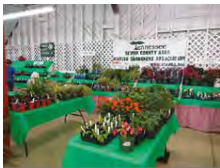
On the cover: A plethora of offerings in the SCAMGA area at the plant sale.