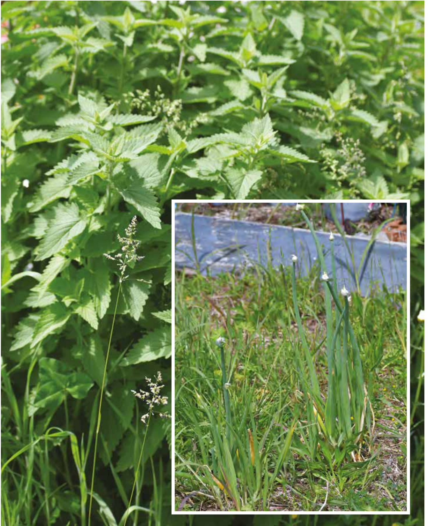
Mint & Egyptian Walking Onions