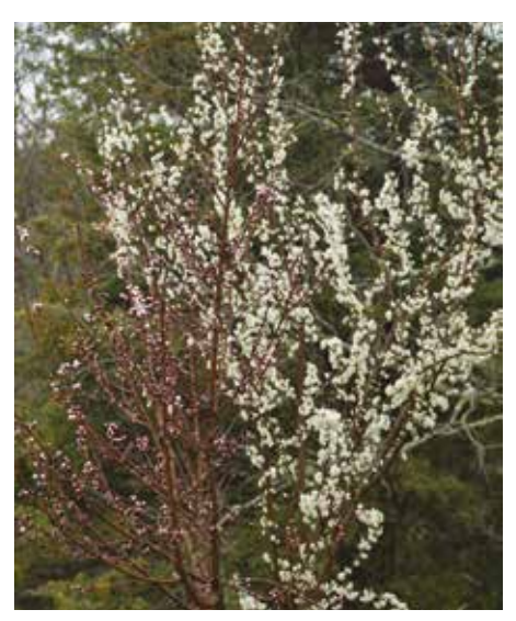
On the cover: A brave Fruit Salad tree (root stock is a Lovell Peach with Elberta Peach, Blenheim Apricot, Santa Rosa Plum grafts) bursts with early blooms during early Spring temps.