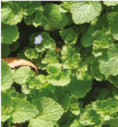
On the cover: Wild Violets in bloom before the January cold snap.