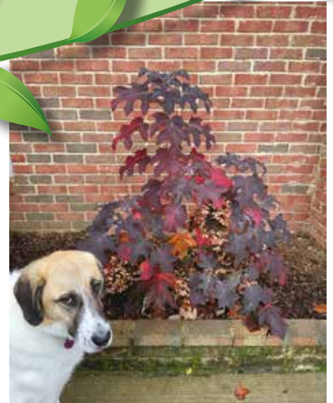
Pippa showing off Diane's Hibiscus, some of the last colors of Fall.

January 23, 2023, 6:30pm (Board meeting January 9th)