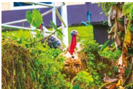
On the cover: Turkeys hide from Thanksgiving in an overgrown garden.