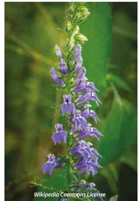
Wikipedia Commons License