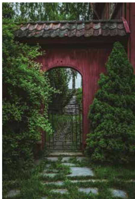
On the cover: A gate in Oslo, Norway becons the nature lover to enter and explore.