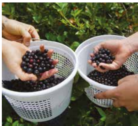
On the cover: Aronia melanocarpa 'Viking' chokeberries are harvested.