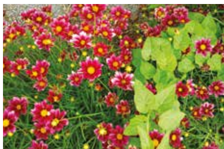
On the cover: garden bed from UT Gardens in Knoxville.