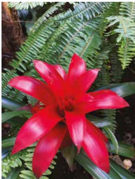
On the cover: A Guzmania Bromeliad peeks out from a fern.